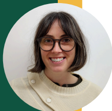
International Student Coordinator & Office Manager